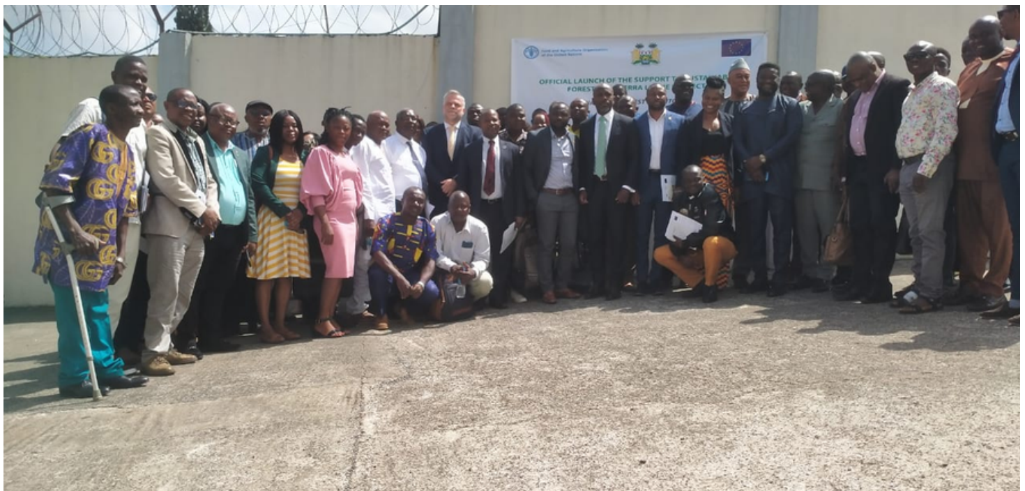
Group Photo of Participants.

In conclusion, Minister Abdulai stressed the importance of capacity building for the Ministry and its supervising agencies to ensure the long-term sustainability of the project. He expressed gratitude to the European Union and the Food and Agricultural Organization for their support in launching the "Support to Sustainable Forestry in Sierra Leone" initiative. The success of this project relies on the collective efforts of all stakeholders and their commitment to environmental conservation and sustainable forestry practices in Sierra Leone.