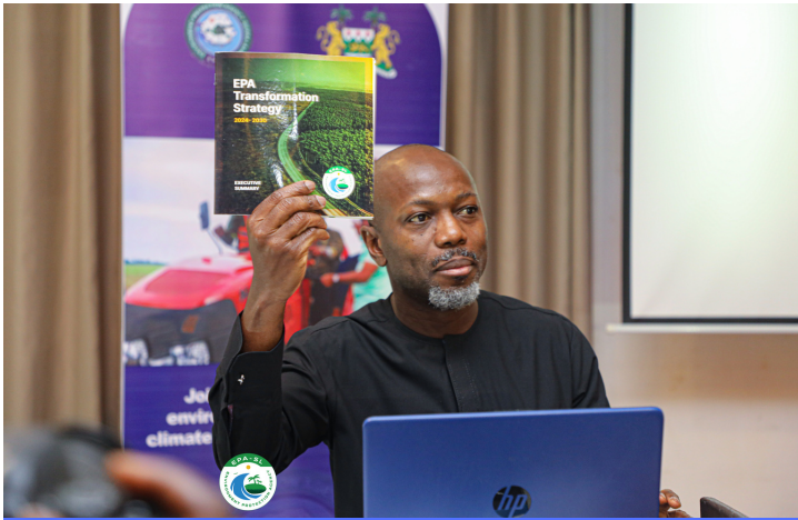
The Minister of the Environment and Climate Change Jiwoh Emmanuel Abdulai