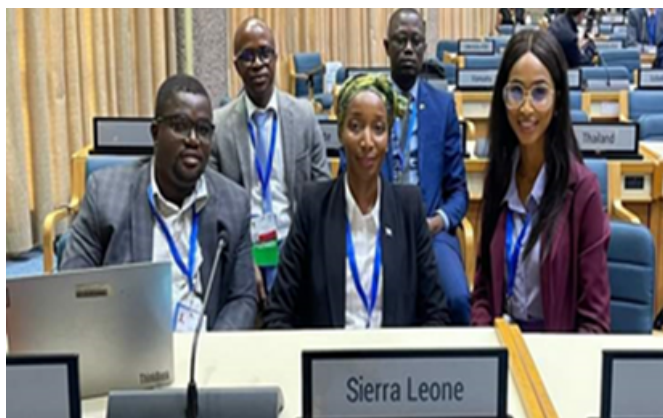
Sierra Leone delegation

Sierra Leone's active participation in the Third Session of the Intergovernmental Negotiating Committee (INC-3) reflects its commitment to addressing the global issue of plastic pollution, especially in marine environments, in line with the United Nations Environment Assembly (UNEA) resolution 5/14. The meeting, hosted by the Government of Kenya at the United Nations Headquarters in Nairobi from November 13th to 19th, 2023, focused on developing an International Legally Binding Instrument on Plastic Pollution.