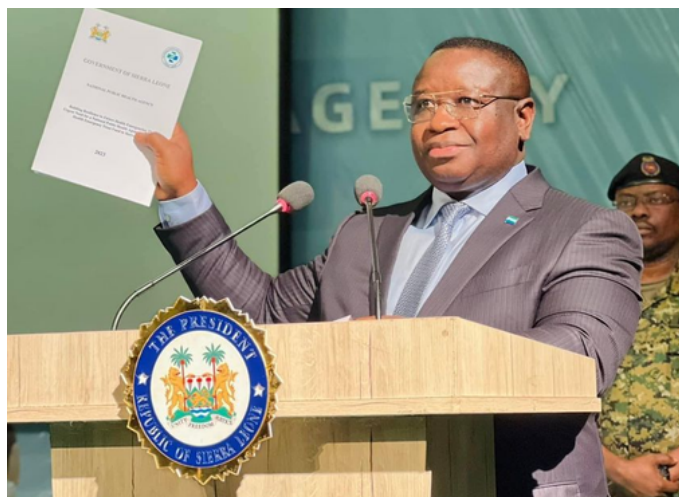
President Bio launches NPHA

The Minister of Health, Dr. Austin Demby, expressed gratitude to President Bio, the government, and health development partners for their unwavering support. He reiterated the ministry's commitment to collaborating with development partners to ensure the NPHA's success in detecting, preventing, and responding to health emergencies. Dr. Demby emphasized a whole-of-government and whole-of-society approach, aligning with a client-centered life stages approach to universal healthcare.