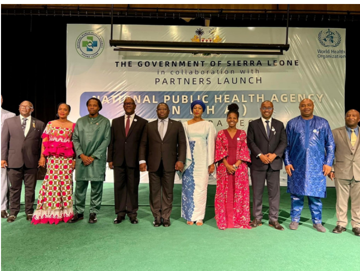
High Delegation witness the launching ceremony of NPHA

Dr. Tedros Adhanom Ghebreyesus, the Director-General of the World Health Organization (WHO), in a video message relayed during the launch, congratulated President Bio, the Minister of Health, and the people of Sierra Leone for establishing this foundational institution. Dr. Tedros highlighted the agency's role in providing science-based leadership, expertise, and coordination for public health, building on existing support through the WHO Regional Emergency Preparedness and Response Flagship program.