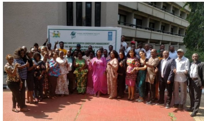
Group Photo of participants.

Expressing optimism about the project rollout, Mr. Ampiah outlined its objectives, such as ensuring continuous water supply to Freetown, biodiversity conservation, carbon storage, and land reclamation. He called for the collective support of MDAs, civil societies, the media, and other relevant partners to assist the government in addressing critical environmental issues, particularly those related to the WAP project..