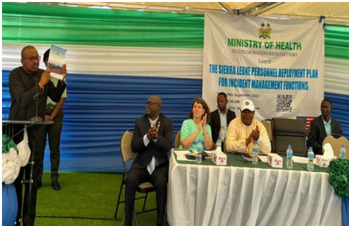
VP Launches the Sierra Leone Personnel Deployment Plan and Mechanisms for Surge Development

The Honourable Vice President Dr. Juldeh Jalloh officially launched the Sierra Leone Personnel Deployment Plan and Mechanism for Surge Deployment on the 28th of July 2023 at the EOC Building, Wilkinson Road, Cockerill, Freetown. The launch marked the beginning of a new era in preparedness and response to public health emergencies. Delivering the keynote address, Honourable Vice President Dr. Mohamed Juldeh Jalloh emphasized the plan's alignment with the nation's strategic vision and its crucial role in enhancing preparedness and response capabilities. The plan symbolizes a significant leap forward in safeguarding the health and well-being of the population.