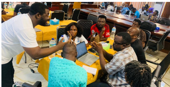
Participants During Group Discussion

This comprehensive and collaborative approach undertaken during the Annual Staff Retreat reflects the commitment of the Sierra Leone National One Health RCCE to fostering innovation, teamwork, and collective growth in addressing public health challenges.